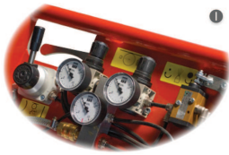
Pneumatic control of all functions, clearly arranged