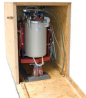
Compact SMG transport crate with fixing points