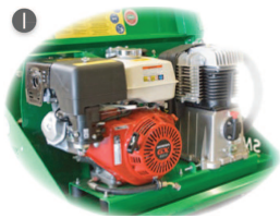
1 Air-cooled petrol engine for hydraulic - and compressor drive (electric motor available)